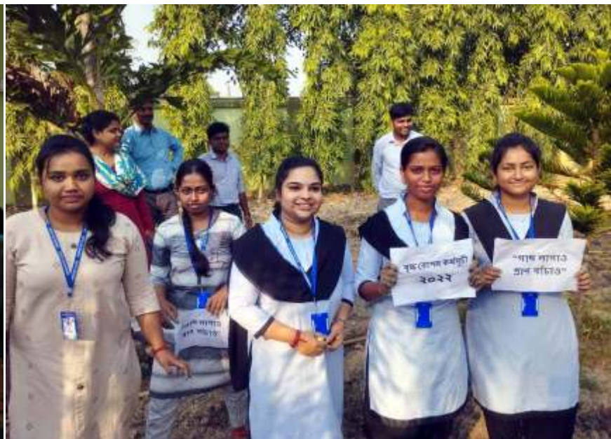
Different activities of students at Sundarban B.Ed College and Sundarban Primary Teachers' Training Institute. Beside the course curriculum, the college stresses on overall development of students through social and environmental awareness