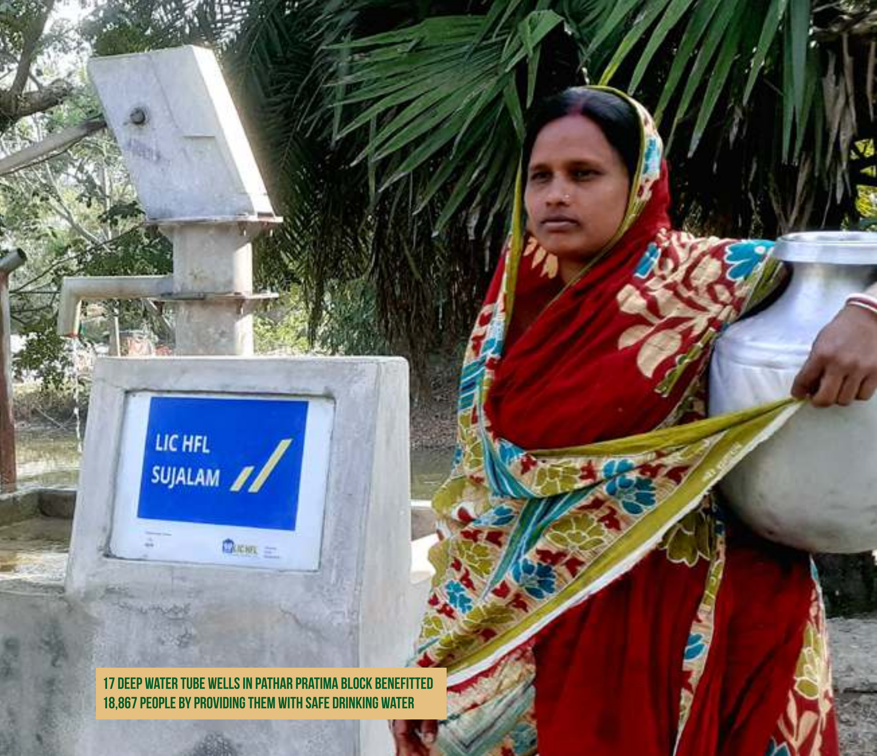
17 DEEP WATER TUBE WELLS IN PATHAR PRATIMA BLOCK BENEFITTED 18,867 PEOPLE BY PROVIDING THEM WITH SAFE DRINKING WATER