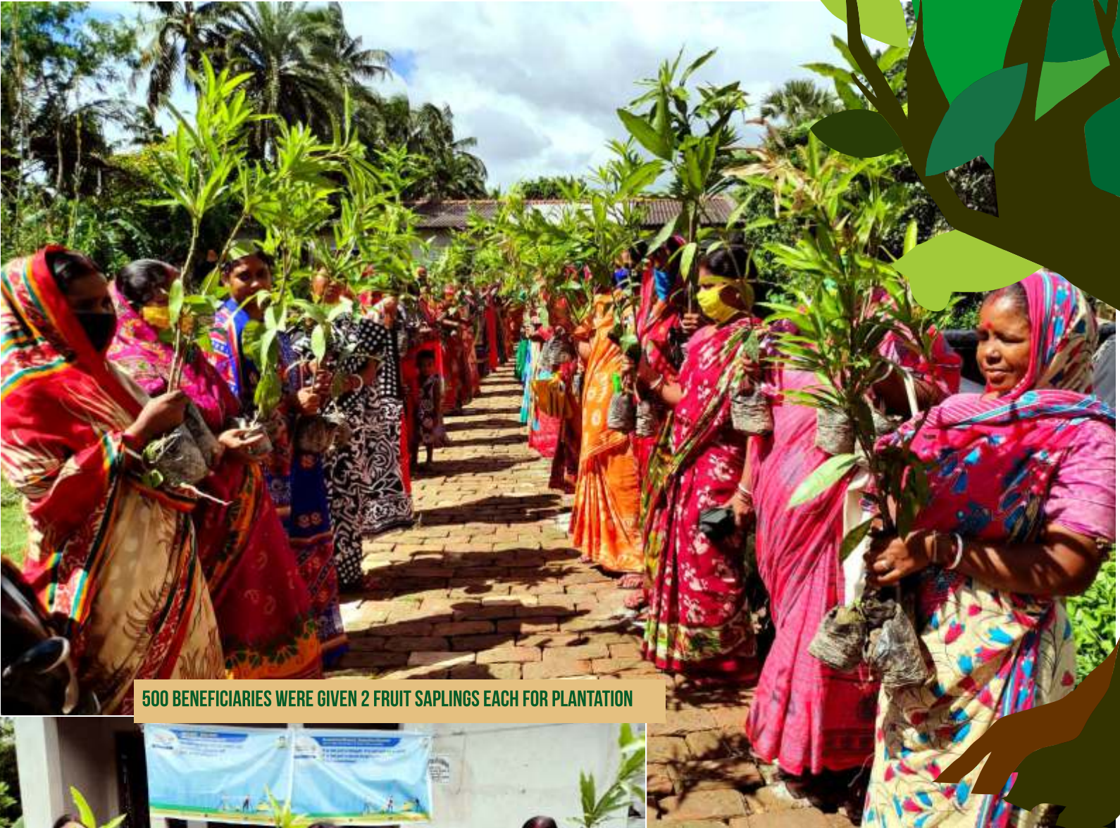
500 BENEFICIARIES WERE GIVEN 2 FRUIT SAPLINGS EACH FOR PLANTATION